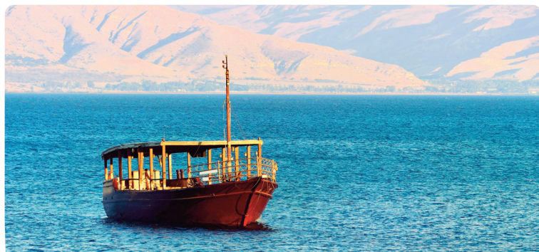
Boat ride at Sea of Galilee