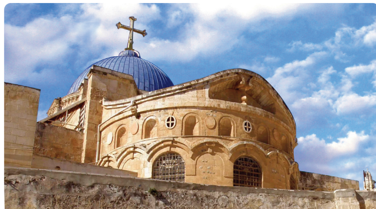
Church of the Holy Sepulchre