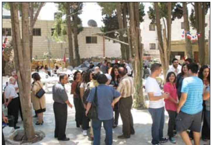
An opportunity for Ramallah parishioners to socialize