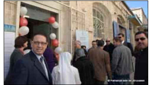
The Society of St. Yves works under the patronage of the Latin Patriarchate in Jerusalem.