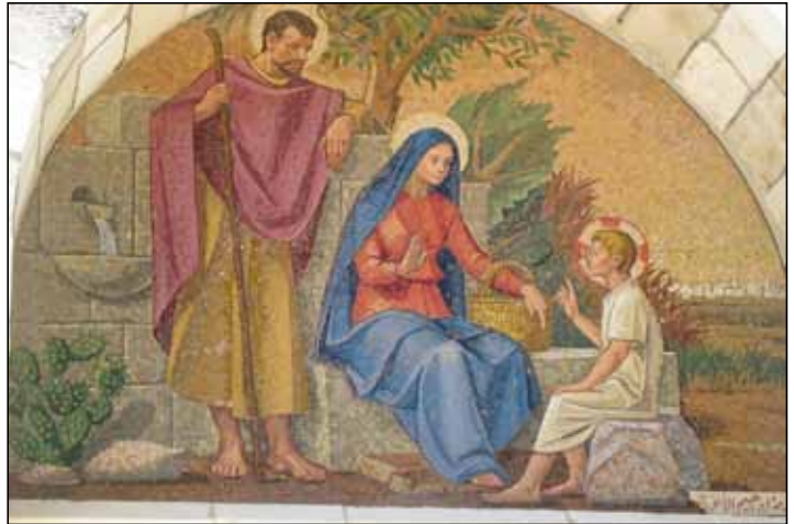
Mosaic in the Holy Family Parish Church

Services are enlivened by the choir of boys and girls, prayer and meditation groups have been launched such as the JEC (Christian student youth movement), JOC (Christian workers’ youth movement), as well as the Legion of Mary and Caritas. Five years ago, a family community centre was set up in the parish as a place for parishioners’