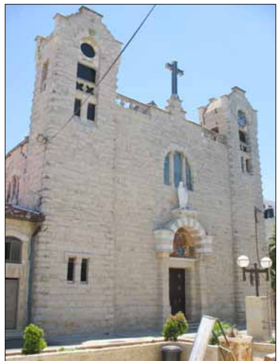
The Parish of the Holy Family