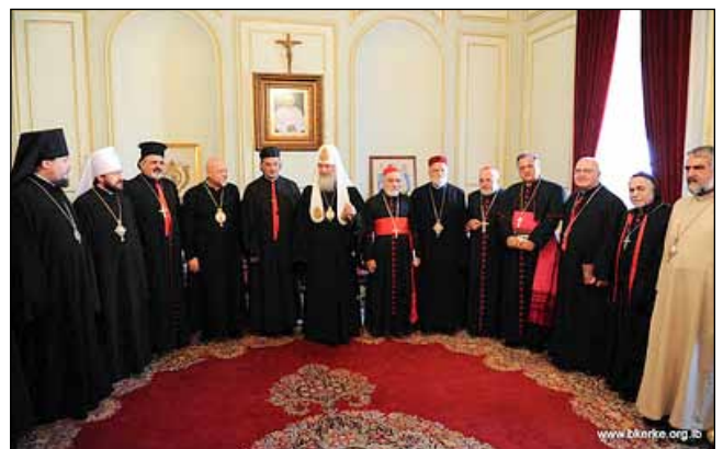
In Bkerke, Catholic Patriarchs met Patriarch Kyrill of Moscow

Along the same lines, I would like to recall the commitment among Christians to dialogue. The 10th meeting of the Council of Churches of the Middle East recently held in Cyprus stressed the willingness of four Christian groups: Catholics, Protestants, Eastern Orthodox and Orthodox for more collaboration and commitment to unity. At the invitation of the Synod for the Middle East last year, we intend to unify the date of Passover. We do so, driven by the desire of our Lord and the unanimous will of the Christian people of the Holy Land.