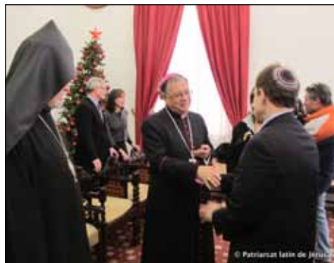
Leaders of Christian Churches gathered to welcome JCPA members