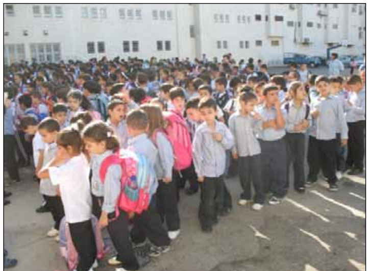
School and High School in Ramallah