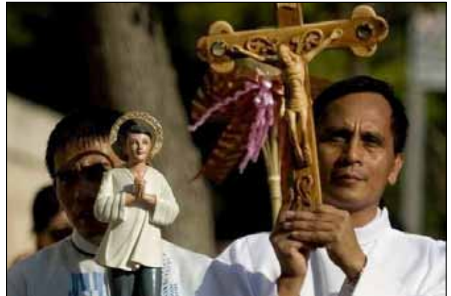
Philippino migrants in the Holy Land

Today, we face a new reality in the Church, the presence of migrant workers and refugees. In Israel alone, there are around 230,000 foreign workers and approximately 30,000 asylum seekers, the vast majority are Christian. They live mostly in Hebrew-speaking Jewish society. In fact, the Hebrew-speaking Vicariate is facing a great challenge to meet the pastoral needs of Catholic immigrants. We must redouble our pastoral efforts to