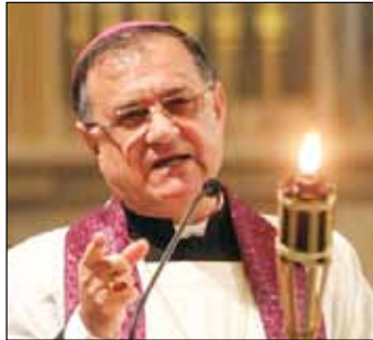
His Beatitude Fouad Twal, Latin Patriarch of Jerusalem

Dear friends present here, dear faithful of the Holy Land (in Israel, Palestine, Jordan and Cyprus); I wish you all a Merry Christmas and a New Year full of hope and peace in your hearts, in your families and your countries.