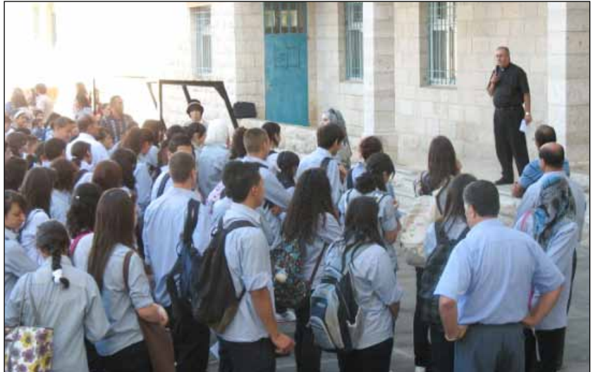
School and High School in Ramallah