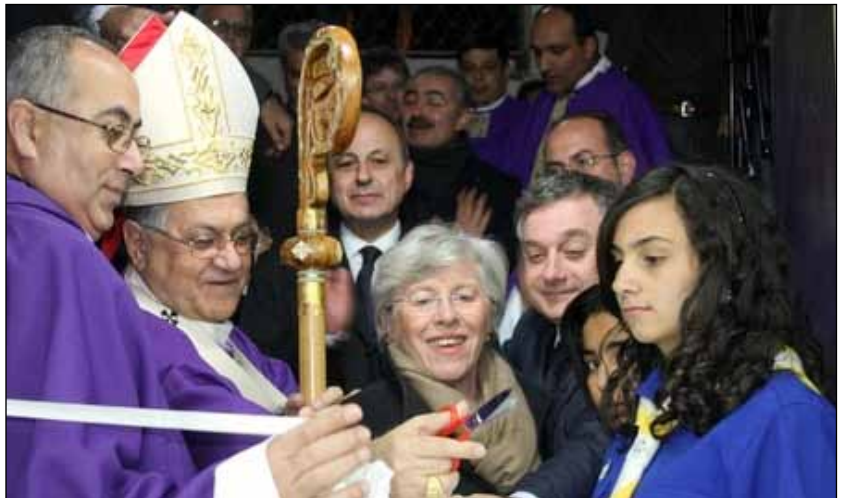
Inauguration of Ahliyyah High School Hotel management department