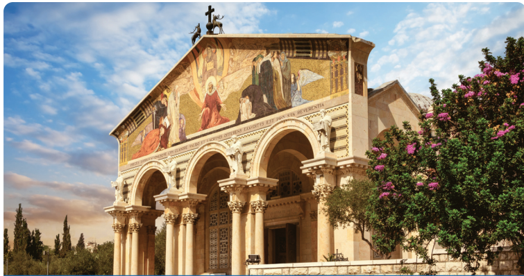
Church of All Nations