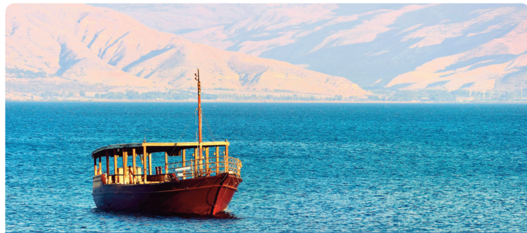
Boat Ride in Sea of Galilee

Mass at Capernaum; Overnight at Pilgerhaus